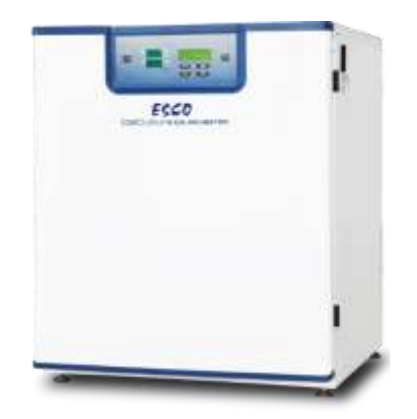
Figure 1. Esco CelCulture® CO2 Incubators with Cooling System

Esco recognized the significance of marine invertebrate cell culture and manufactured the CelCulture<sup>®</sup> CO<sub>2</sub> Incubators with Cooling System (Fig.1). This paper will outline the benefits of using CelCulture<sup>®</sup> for marine invertebrate cell cultivation, taking a look first on the growth requirements of marine invertebrate cells.