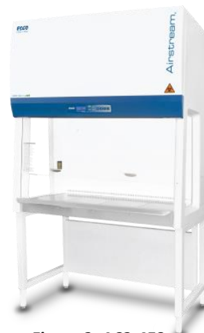
Figure 2: AC2-4E8