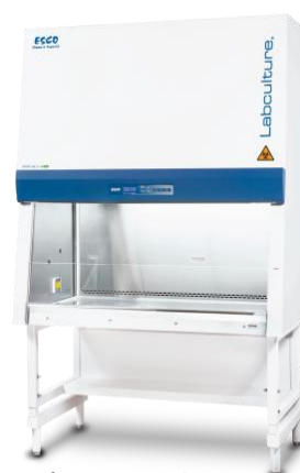
Figure 4: LA2-4A1-E