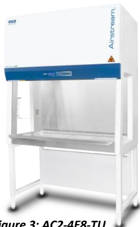
Figure 3: AC2-4E8-TU